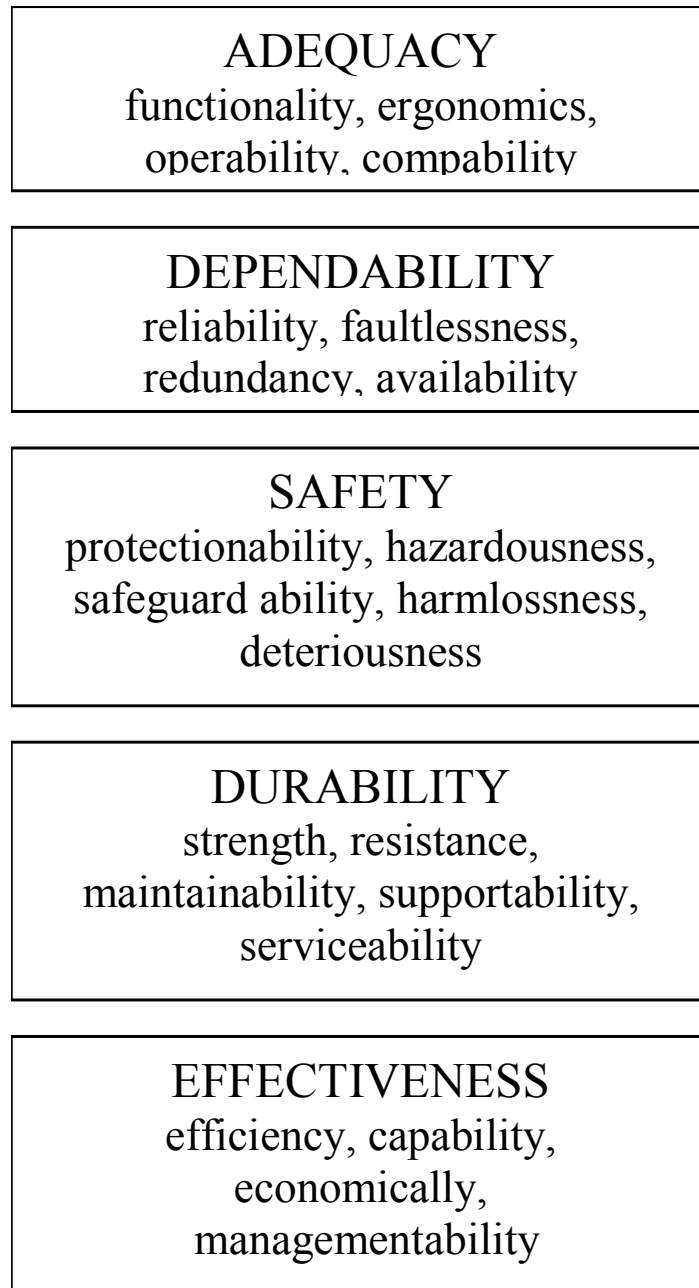
Fig. 2. The main and lateral operation features of machine system

Compatibility – feature of the machine describing adaptation of her working organ structure solution to different technical objects, as well as to existing infrastructure feature.